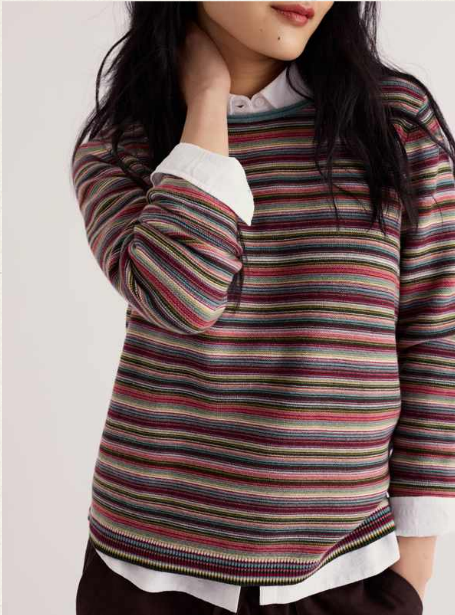
Makers Jumper ripple marks sardine multi · QC 114