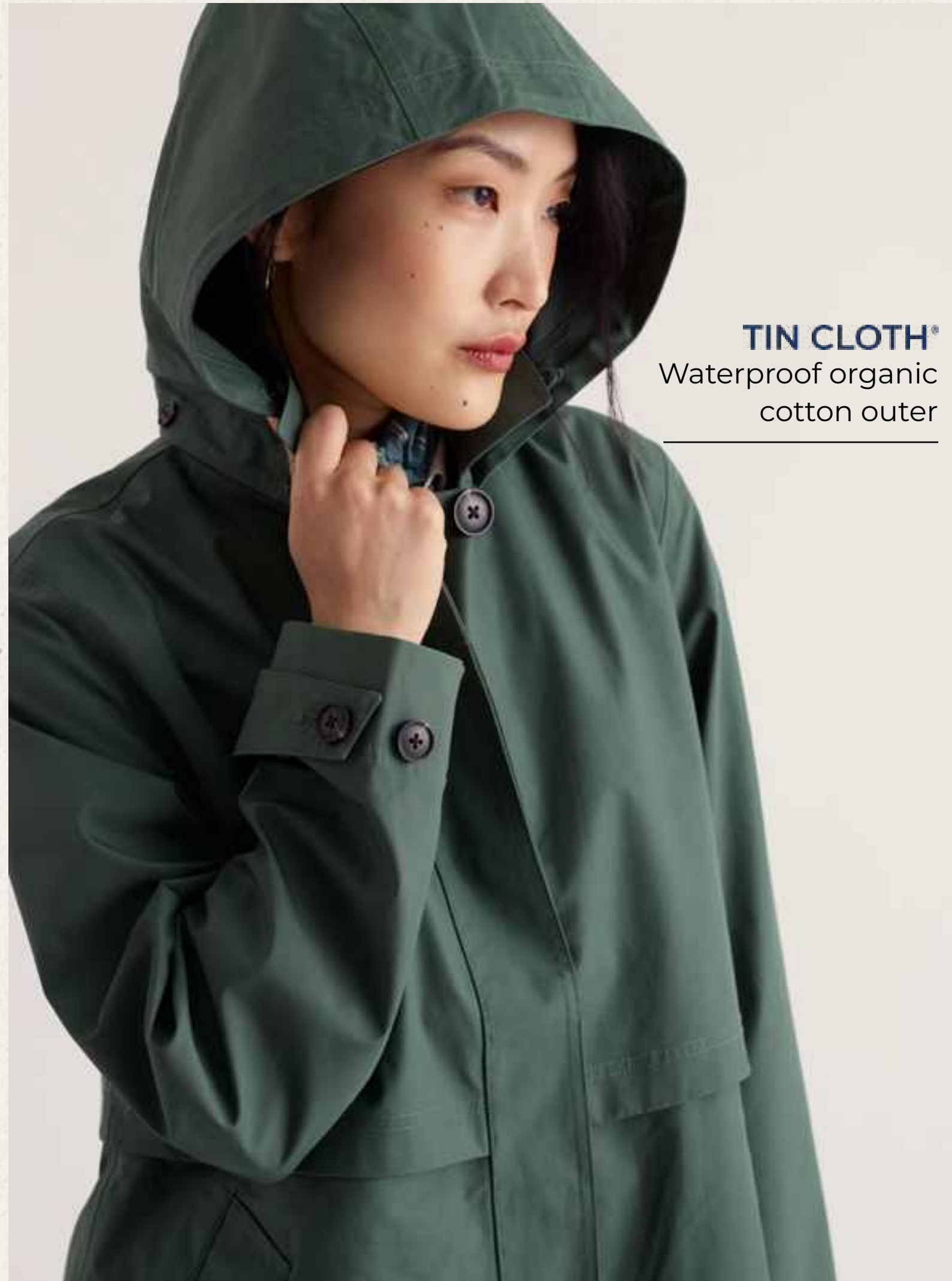
TIN CLOTH® Waterproof organic cotton outer