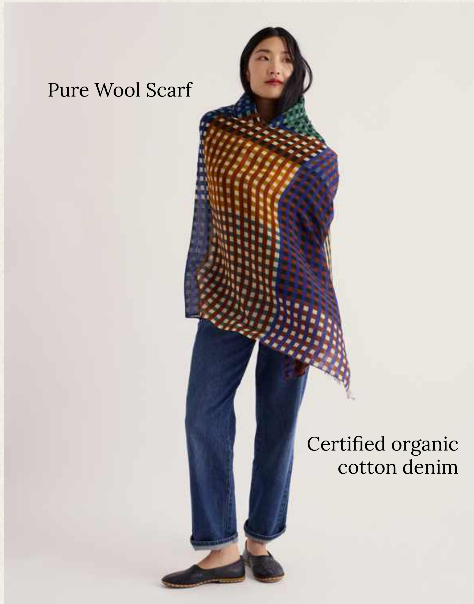
Certified organic cotton denim