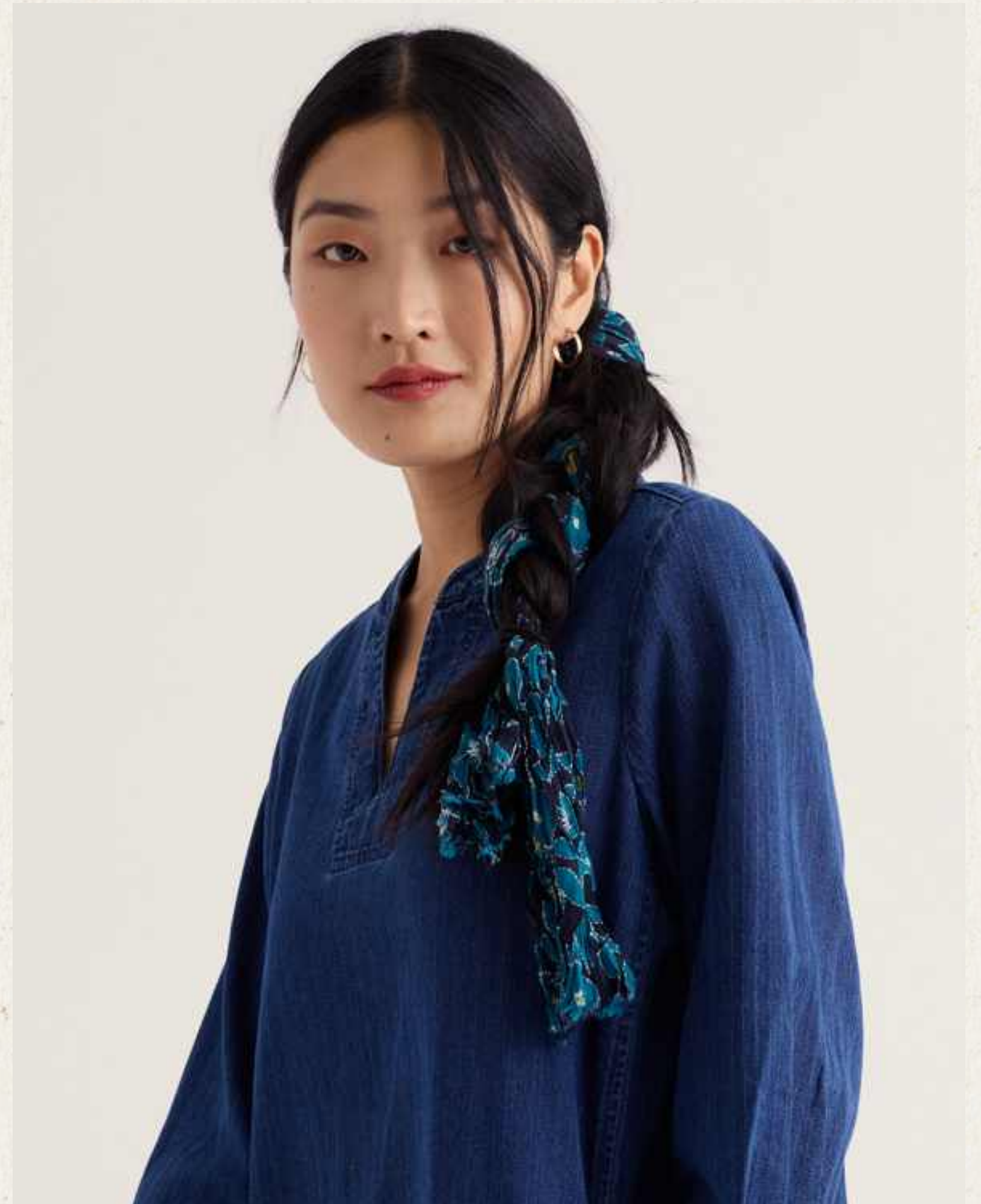
Ponsence Cove Dress mid wash indigo · QC 364