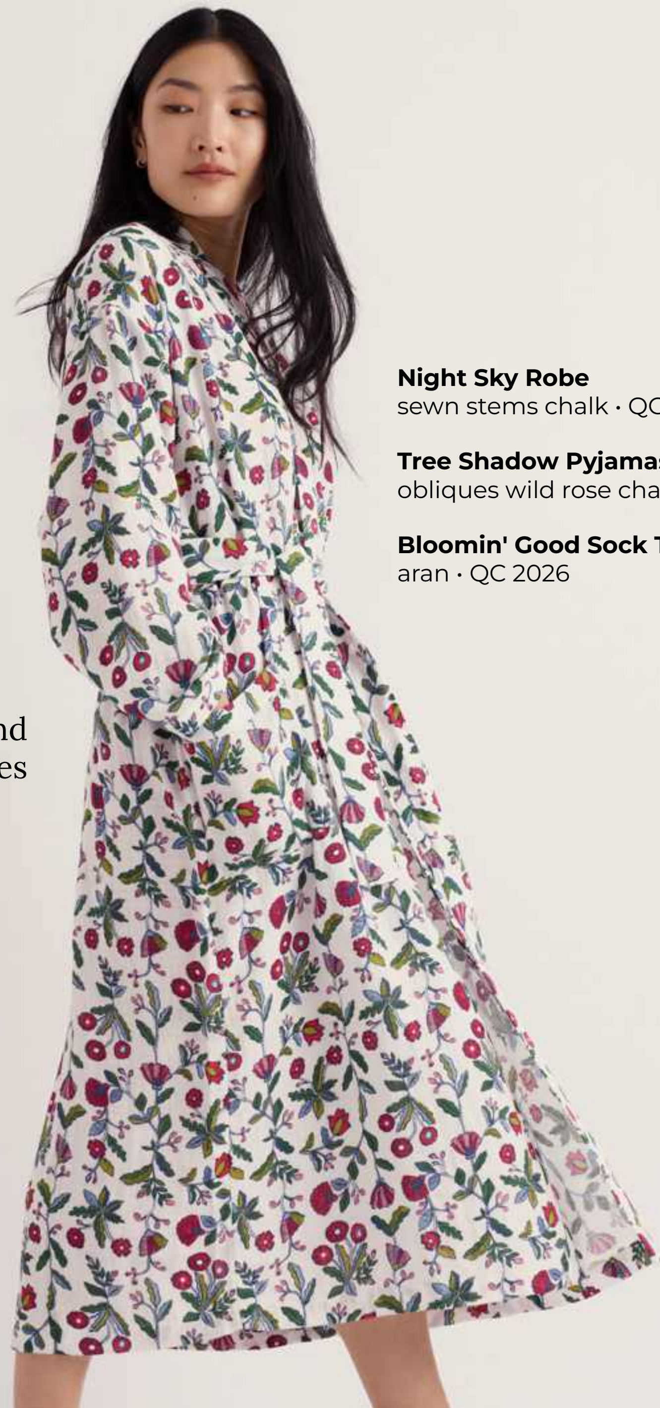
Night Sky Robe sewn stems chalk · QC 452