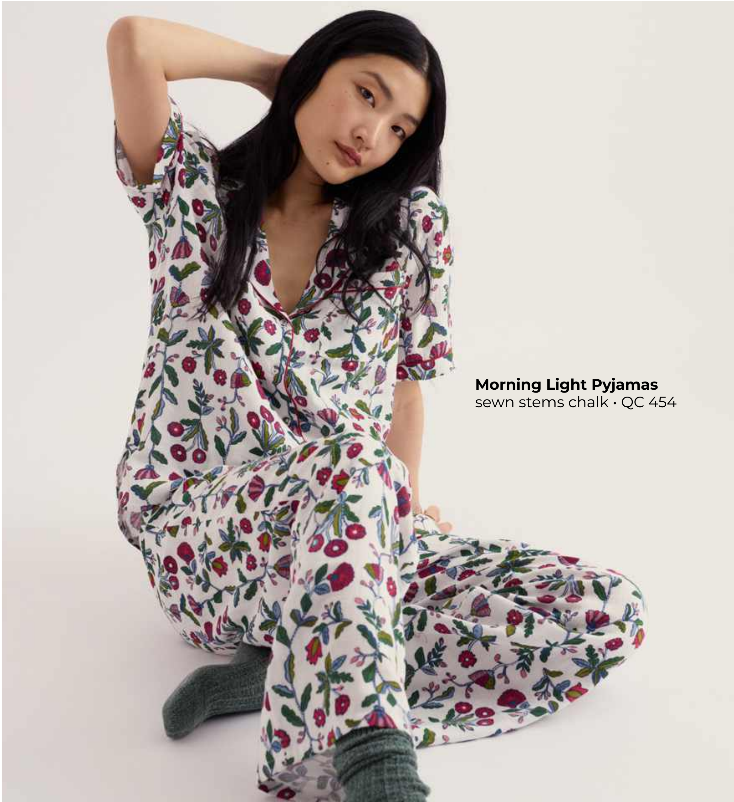
Morning Light Pyjamas sewn stems chalk · QC 454