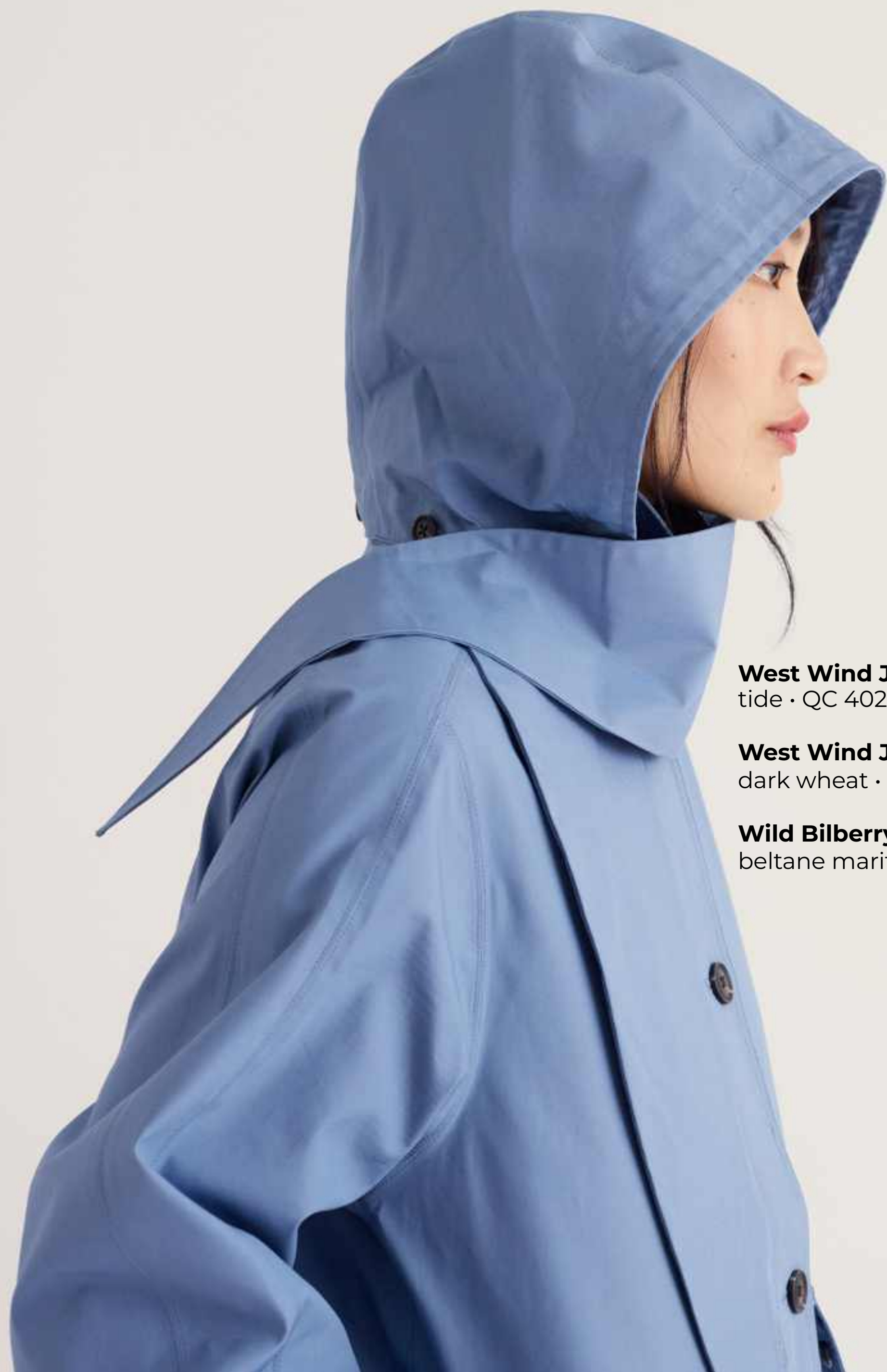
West Wind Jacket tide · QC 4022