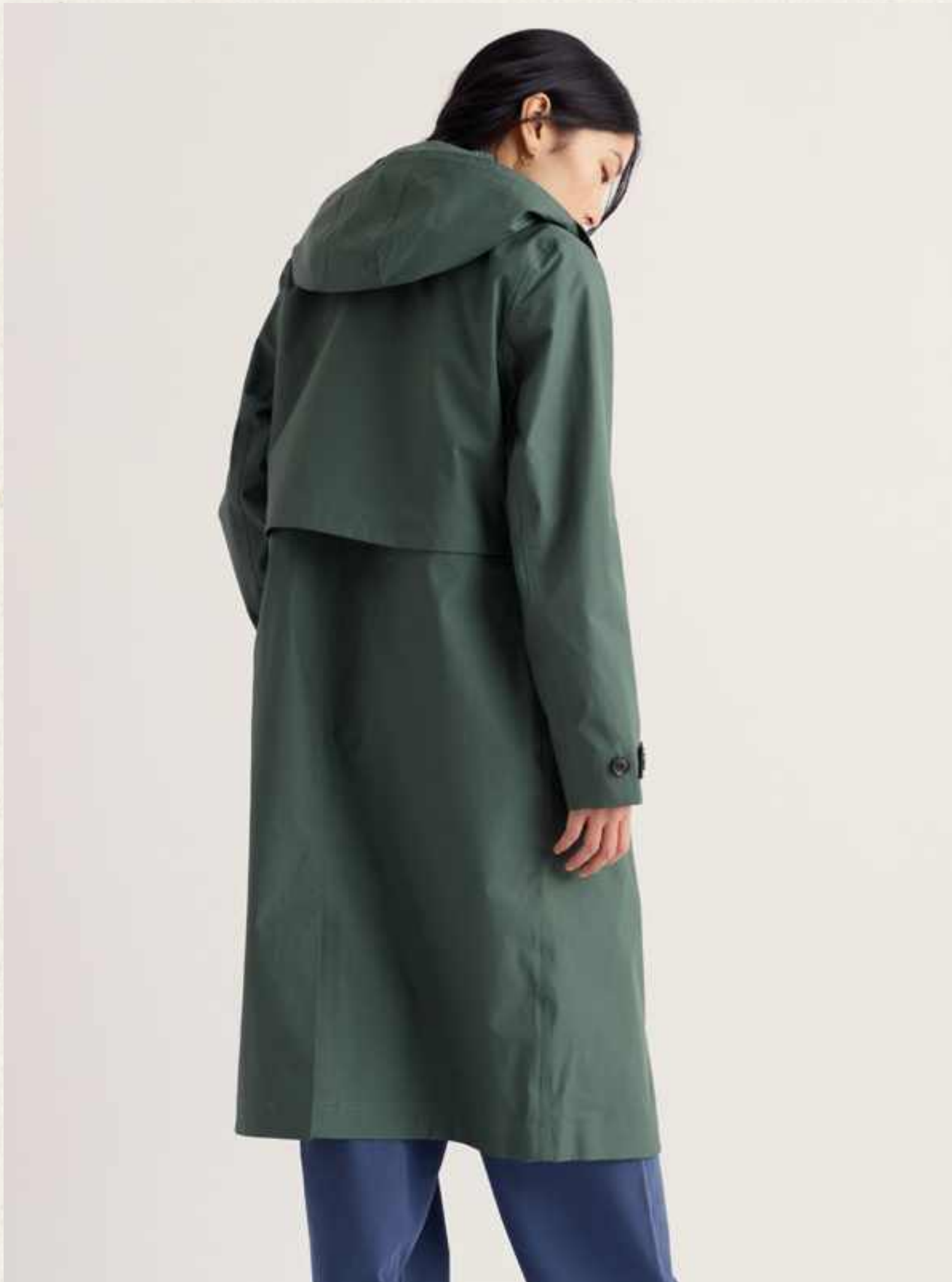
Sea Lights Trench Coat light coppice · QC 4018