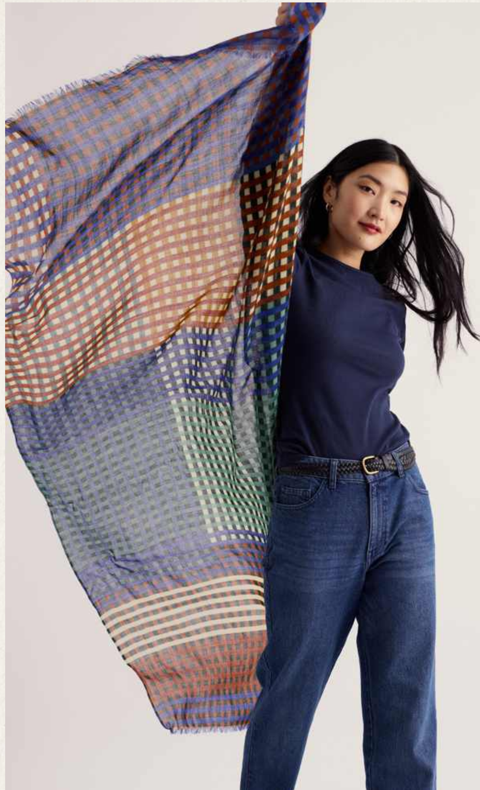
Pure Wool Scarf