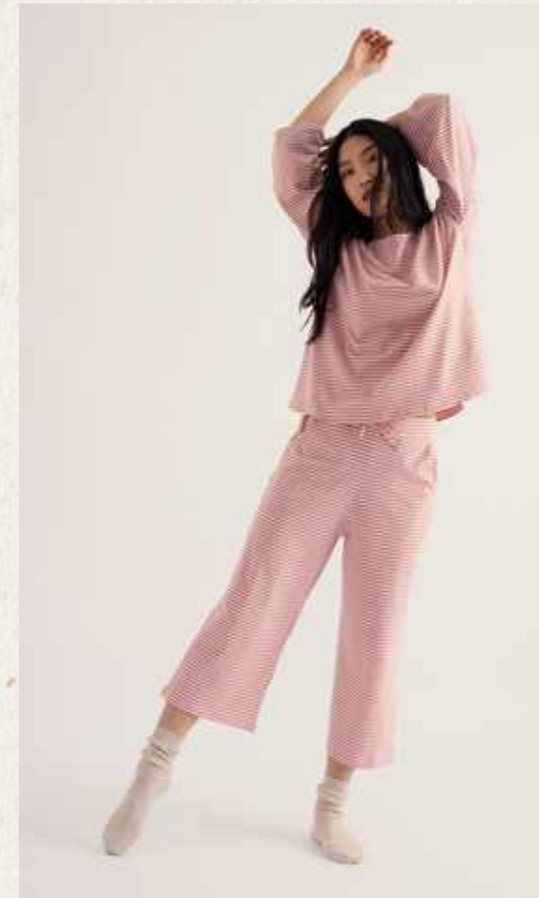
Bloomin' Good Sock Textured aran · QC 2026