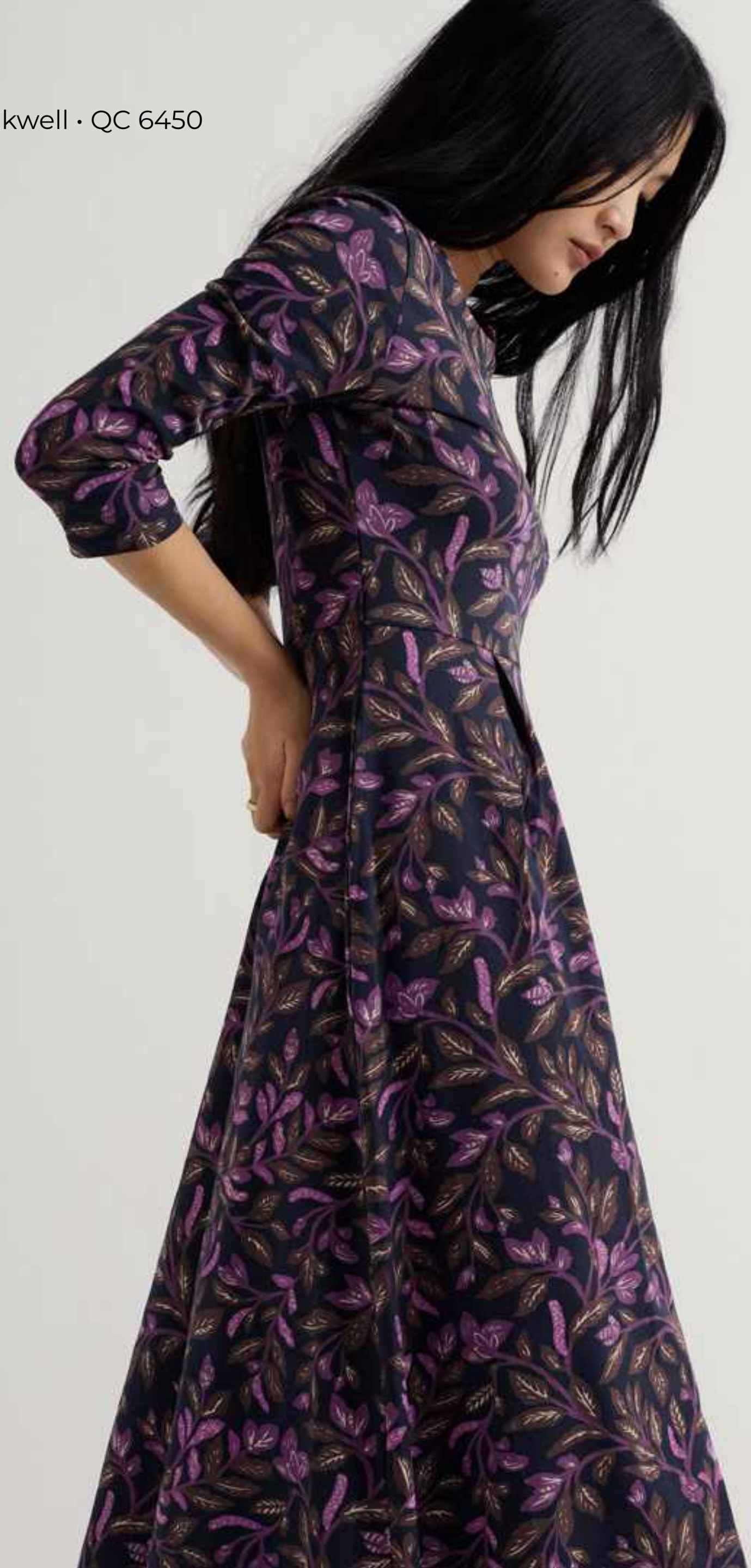
Veronica Dress floral branches inkwell · QC 6450