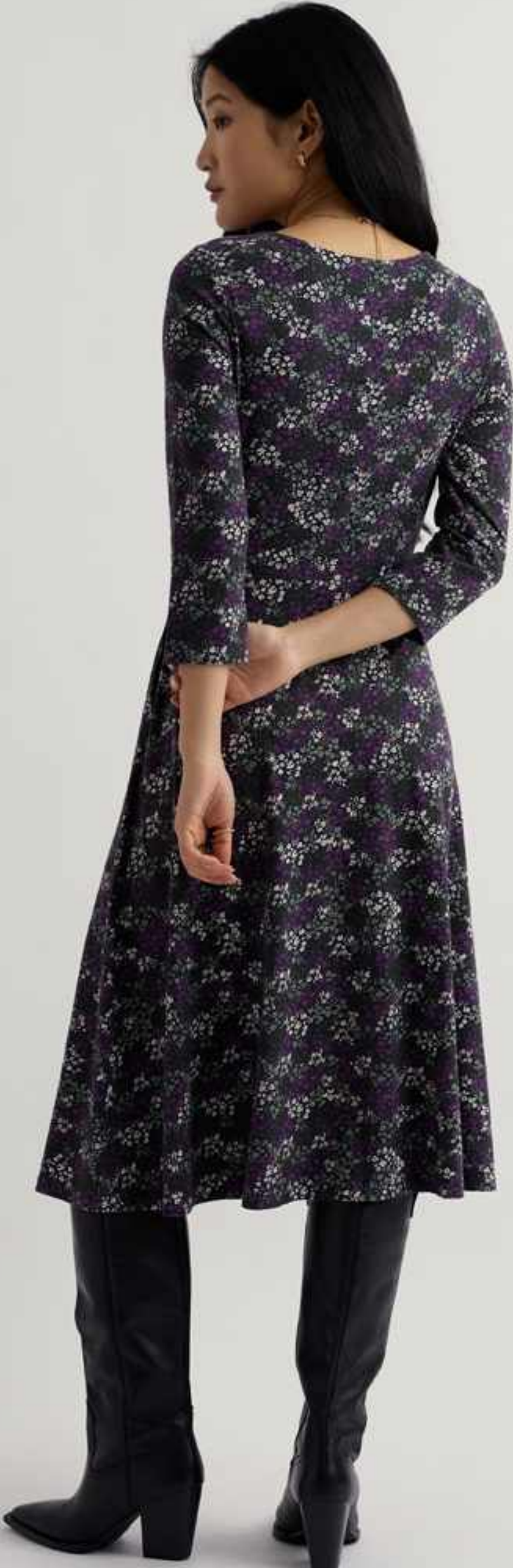
April Dress speckled ditsy mix • QC 6430