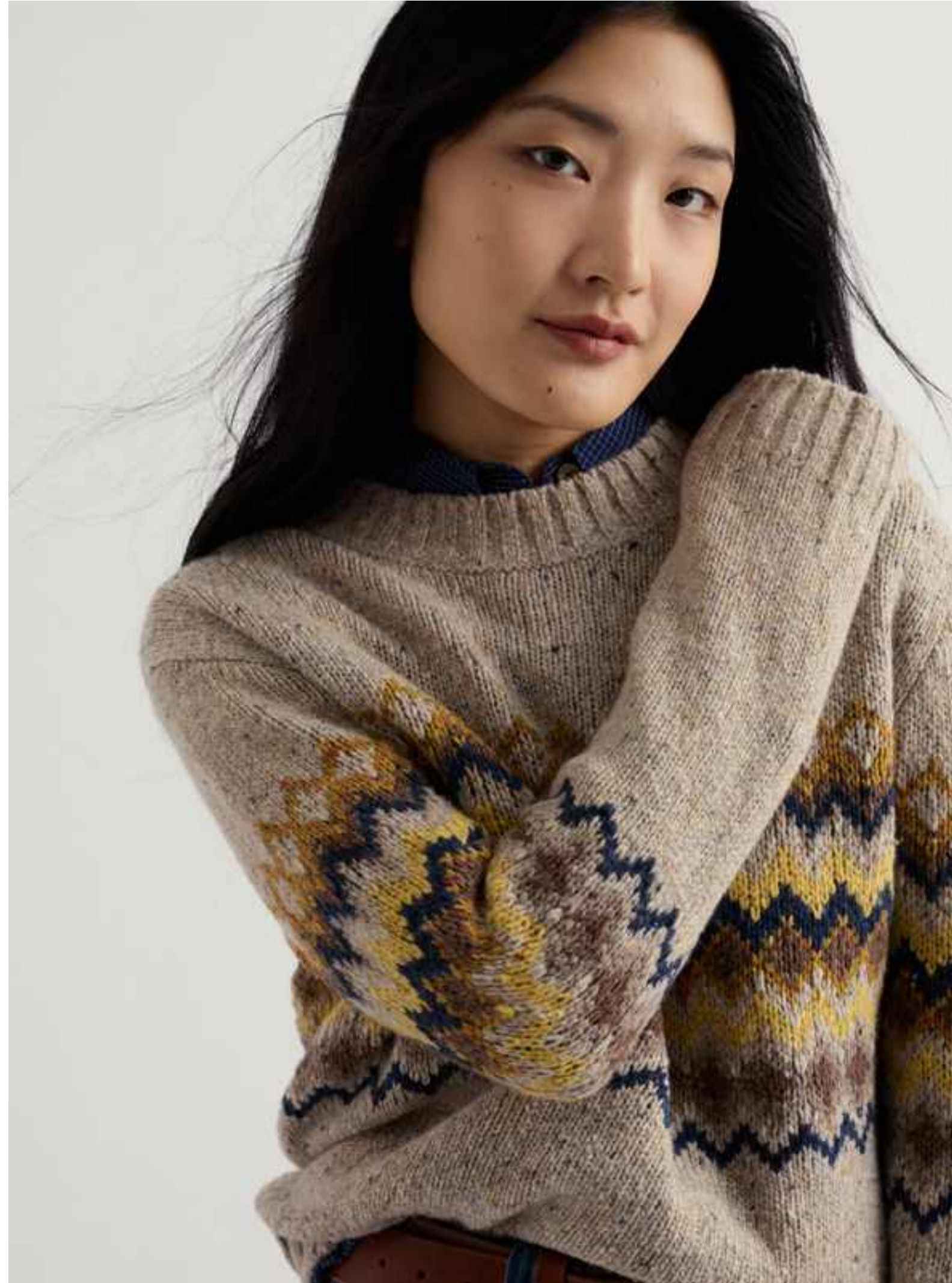
Golden Light Jumper sonata birch seedling mix · QC 6150