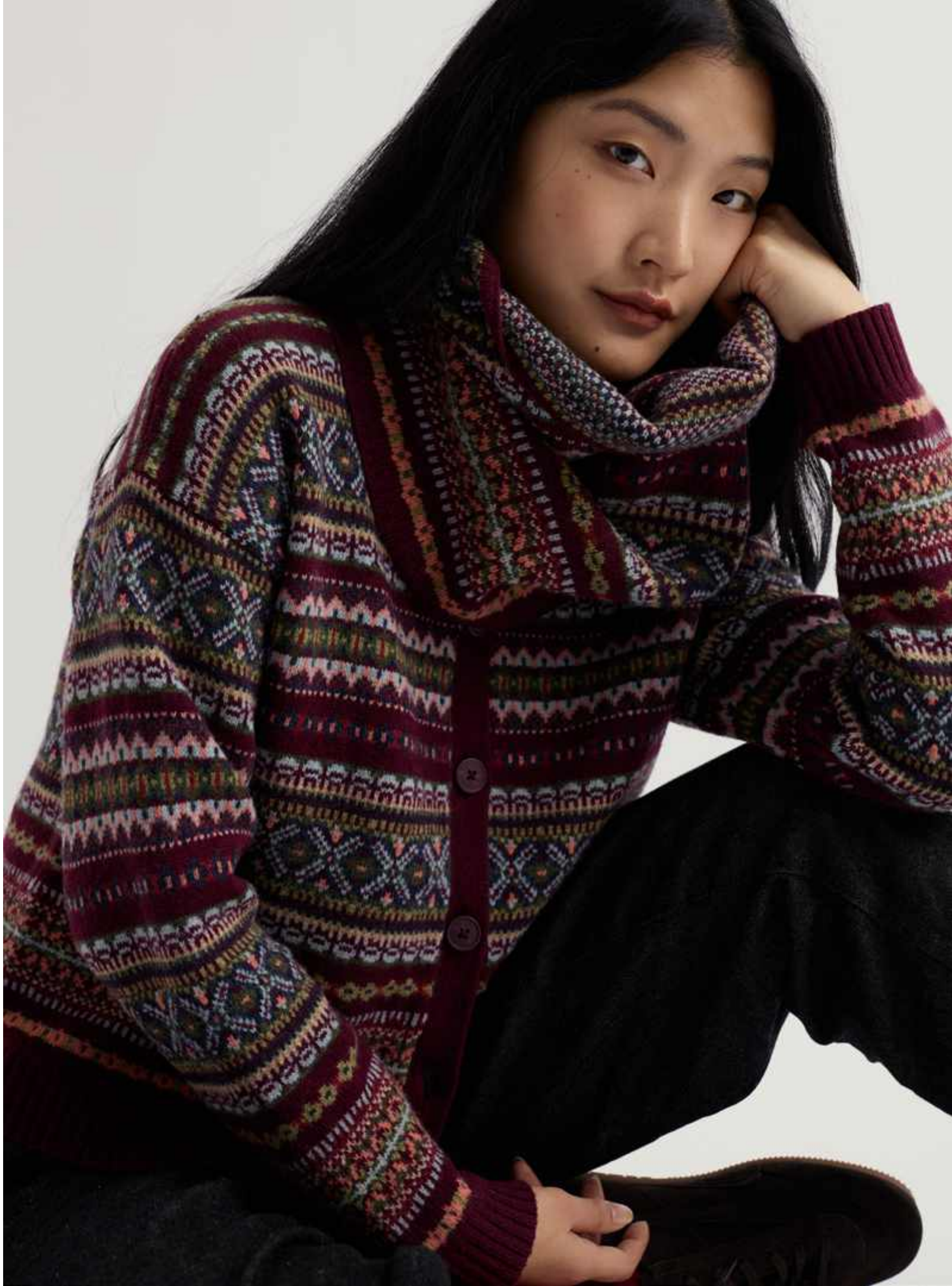
Copper House Cardigan larkspur dark hellebore · QC 5410