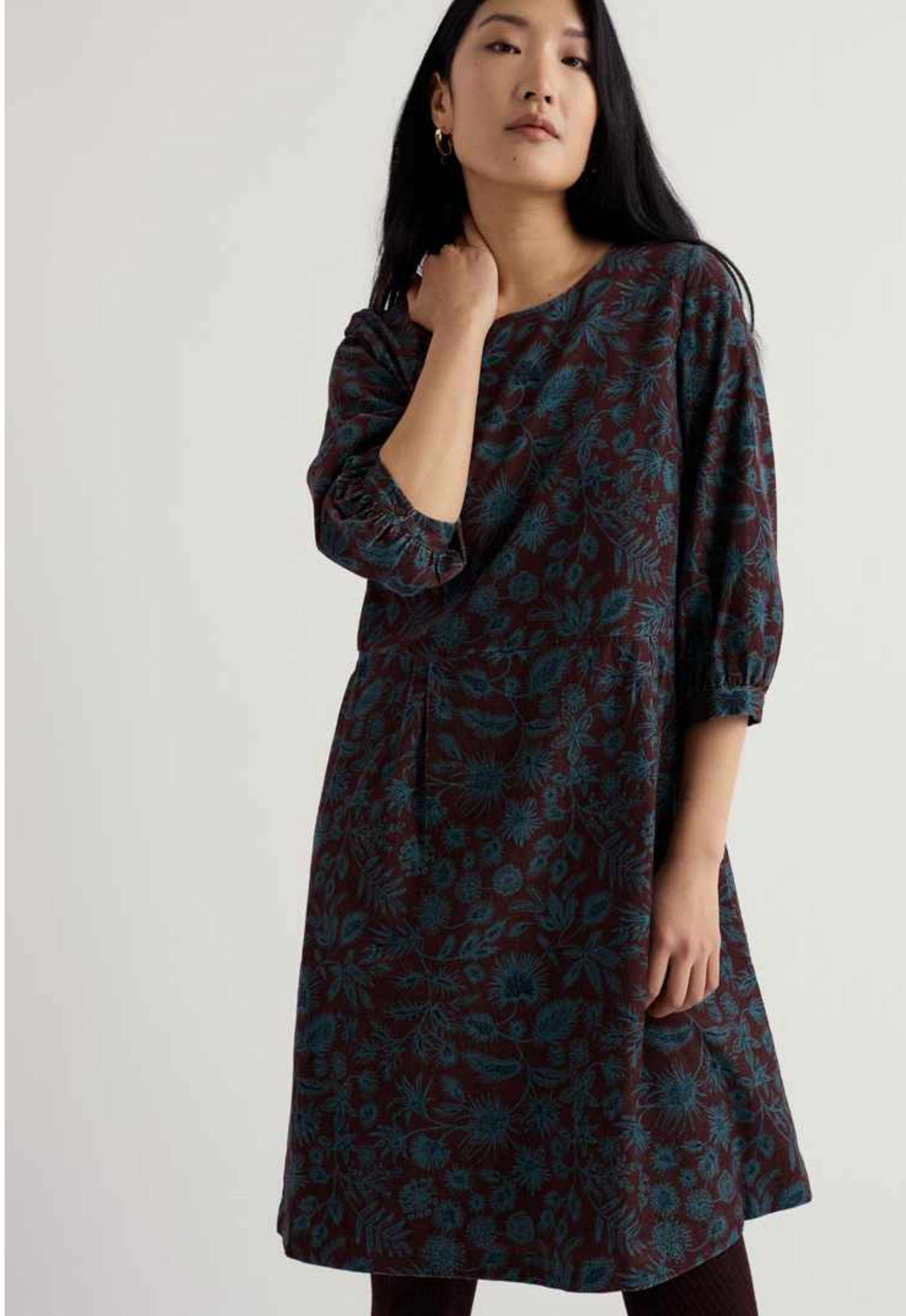
Herb Garden Dress woodland forms dune grass · QC 6630