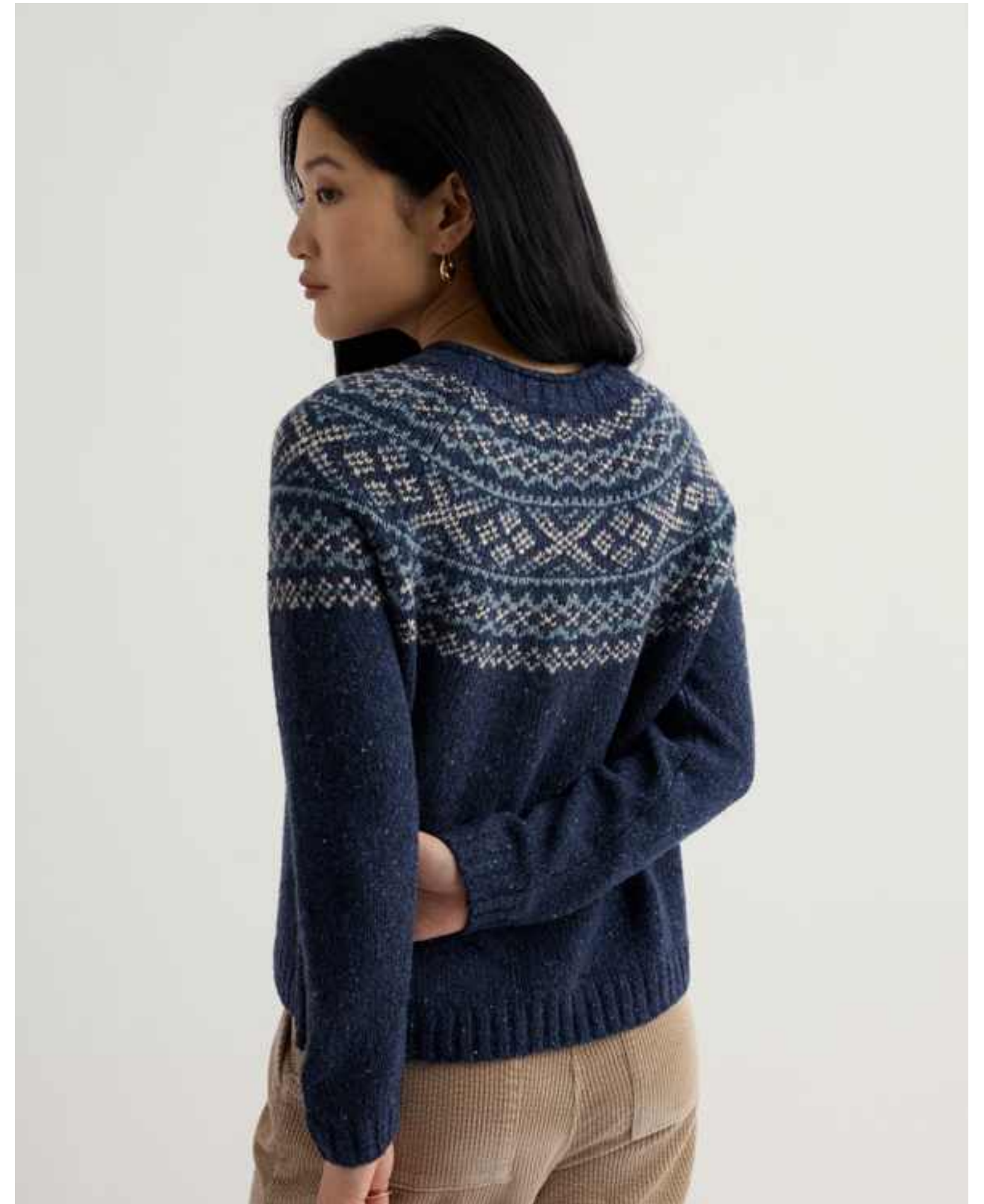
Port Kinnis Jumper shingle bay maritime mix · QC 6810