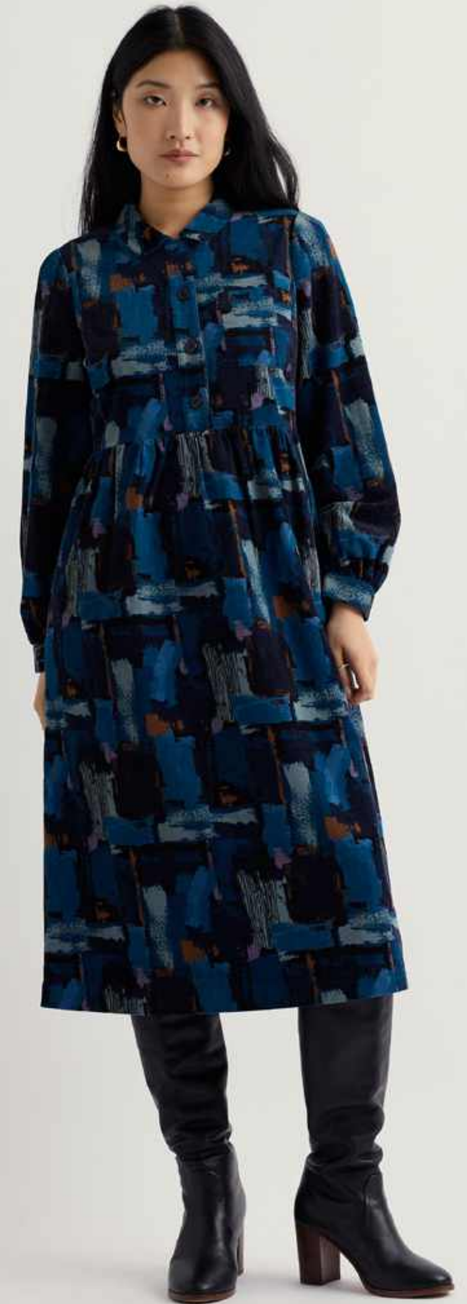
Rosina Dress paint texture maritime · QC 6750