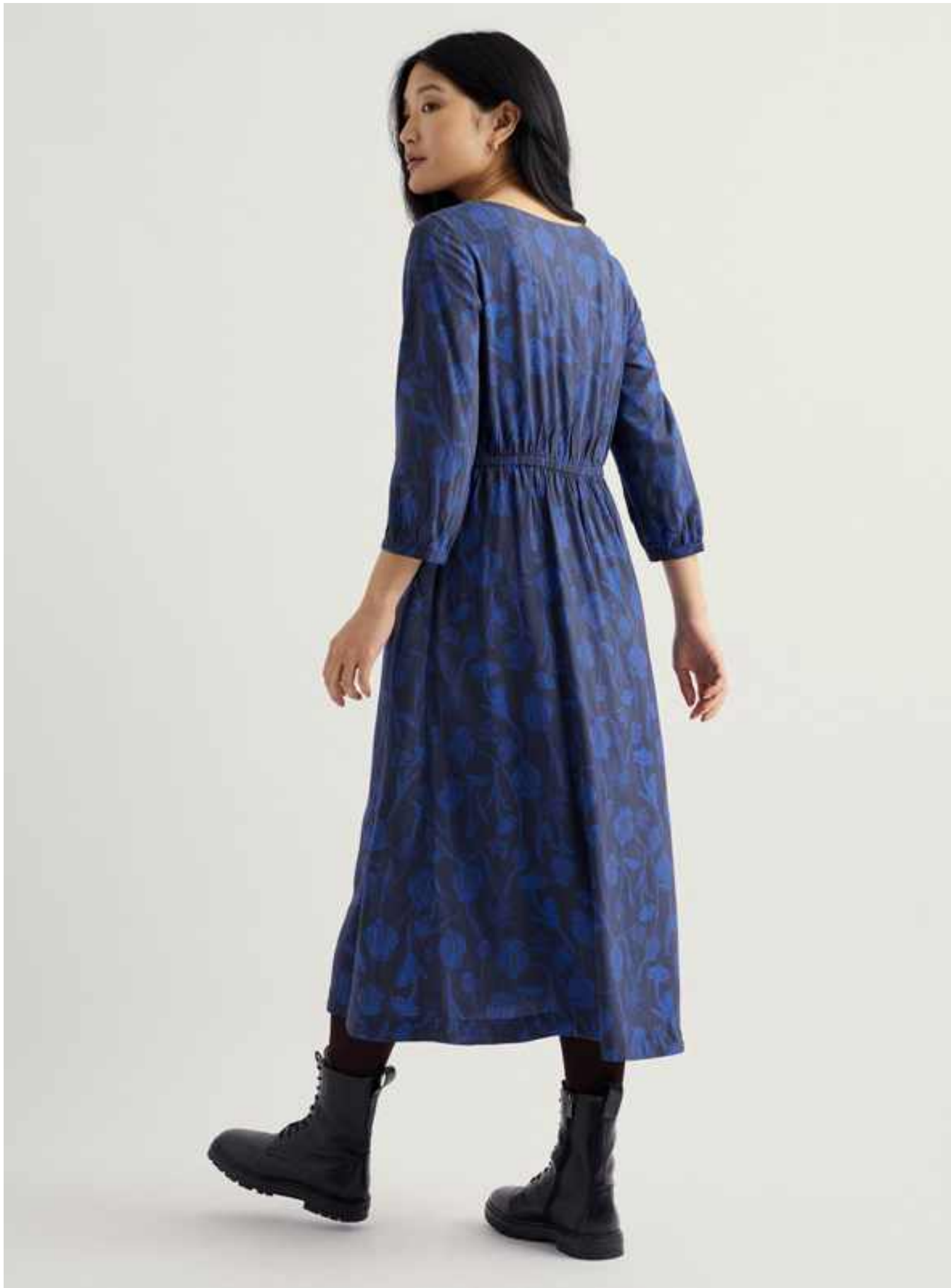
Tilly Dress lino seed pods maritime marine • QC 5910