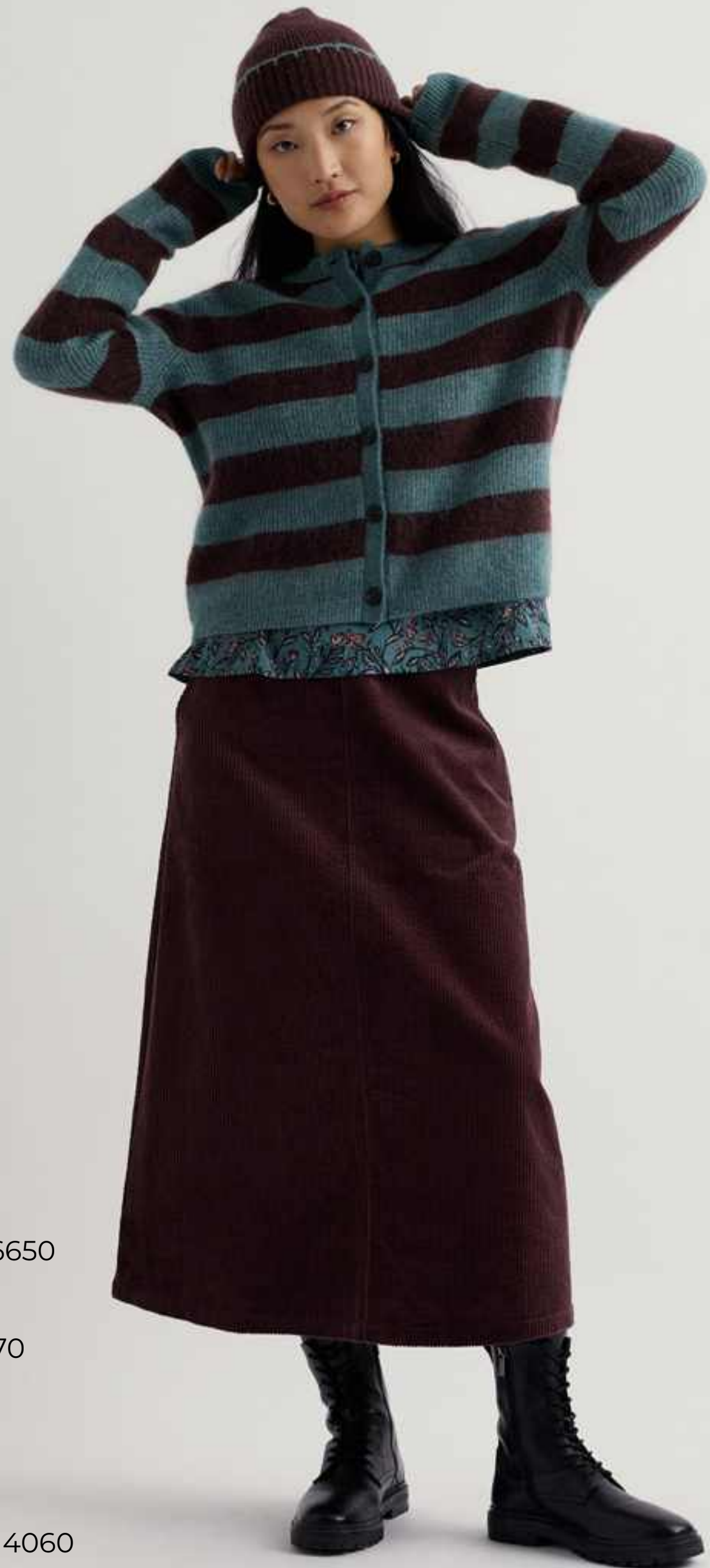
Burnished Light Cardigan harebell seedbed dunegrass • QC 6650