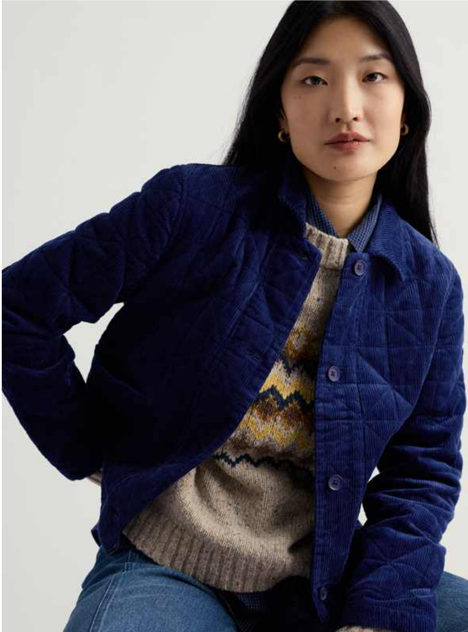
Sea Path Shirt penryn sea cave · QC 5510