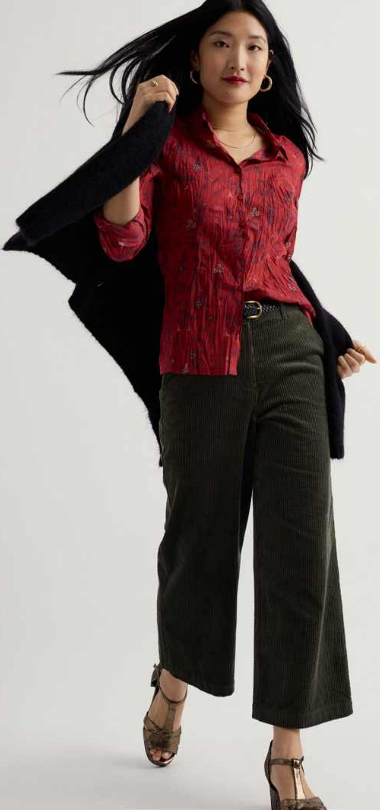
Larissa Shirt tapestry flowers dahlia • QC 6950