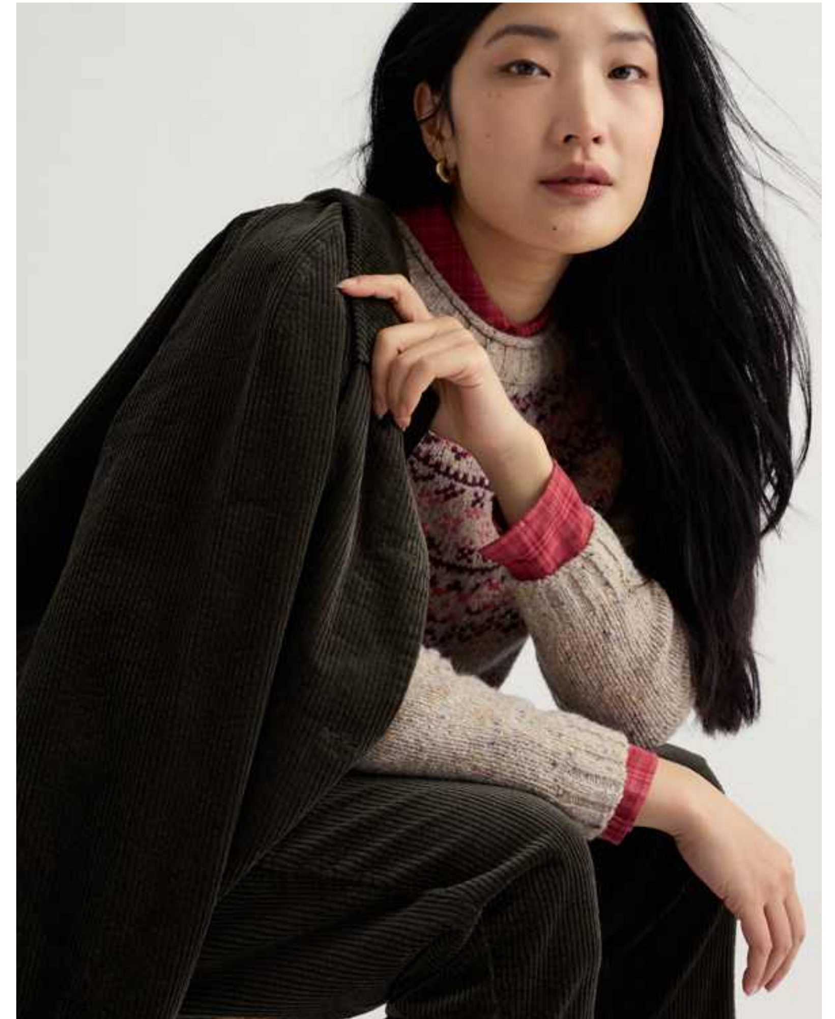
Ocean Mist Jacket nori • QC 5360