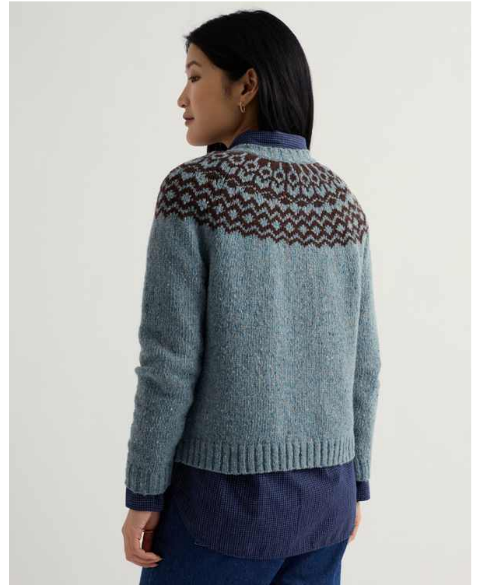
Port Kinnis Cardigan wag tail lichen seedbed • QC 6830